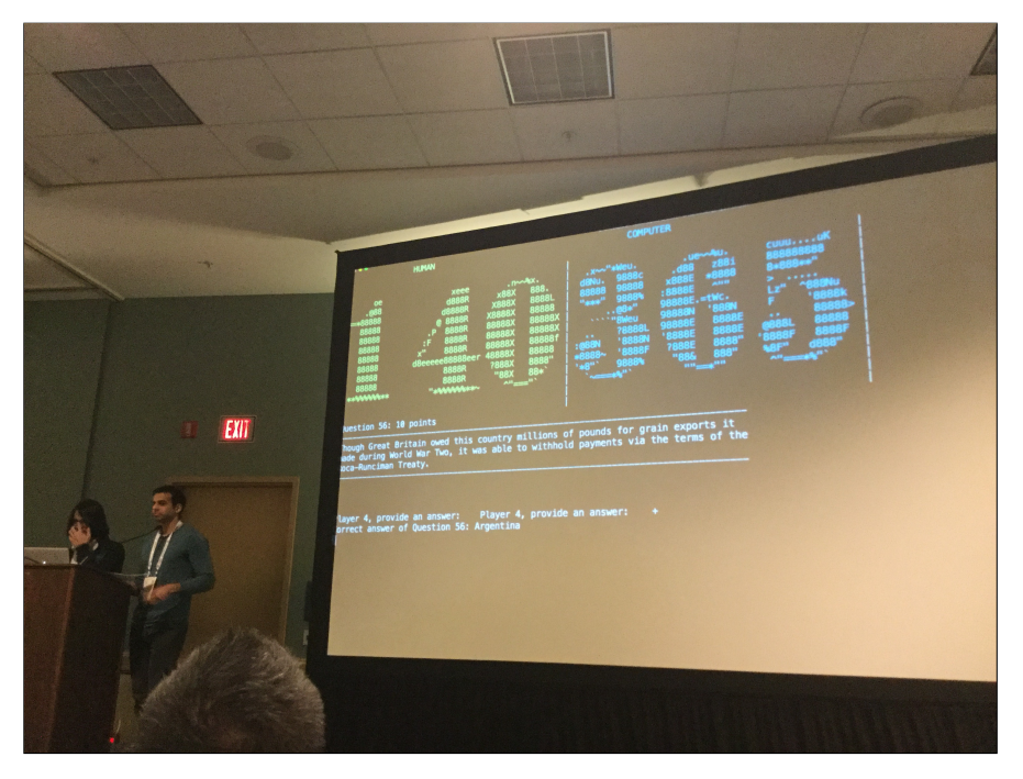
Fig. 3 A live match between six top human quiz experts and our question answering system was held at the HCQA workshop at NIPS 2017.